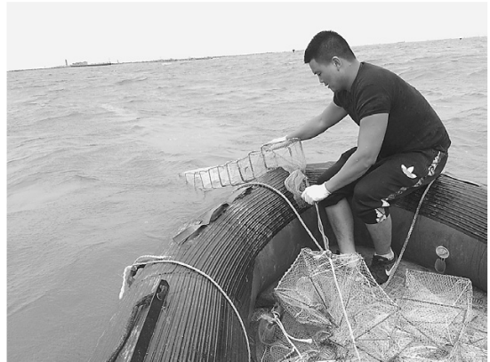
Fig. 2 Photo of a fisherman deploying crab pots in the sea.

This study was carried out in the Luanhe River Estuary between longitude 118°59'24"-119°01'48" E and latitude 39°11'06"-39°09'54" N (Fig. 1). The estuary is subject to irregular, semidiurnal tides. The current study was conducted in 2016–2017 as part of a series of studies to assess the biological sustainable capacity of this area. Samples were collected at monthly in-